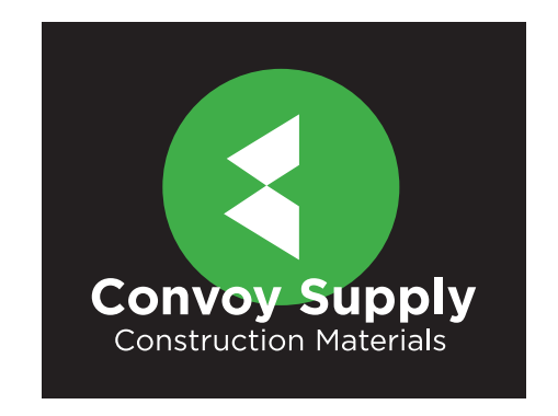
Place a different graphic element behind the logo.