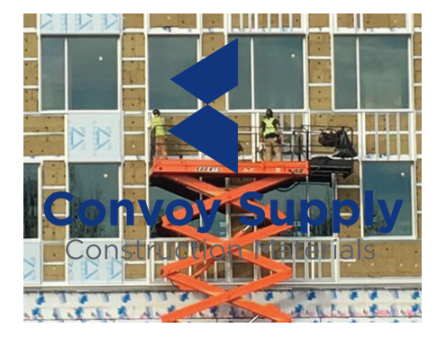
Place over a textured image.

Here are some examples of arrangements to avoid regarding the official logo usage.