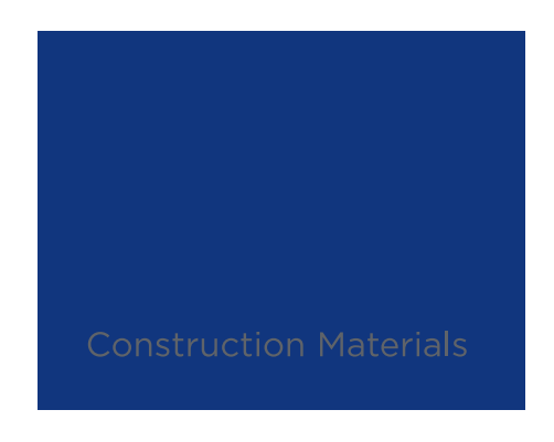
Place over a background color too similar to one of the logo colors.