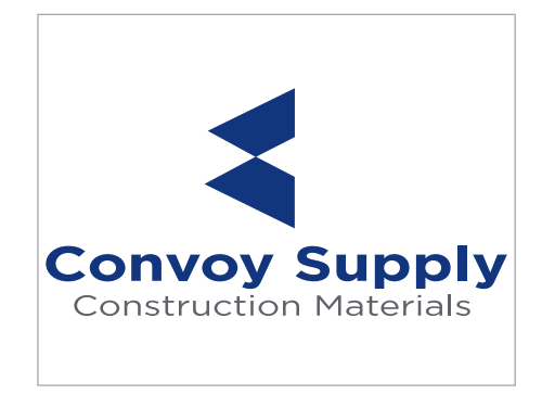
Distort the logo.