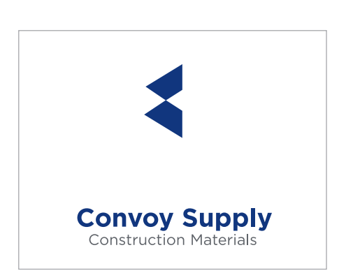
Change the relationship of the chevron to the text.