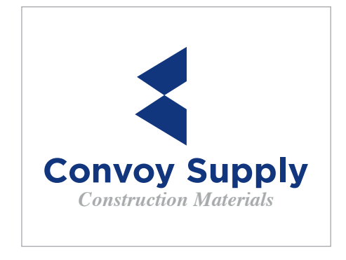
Change any of the fonts.